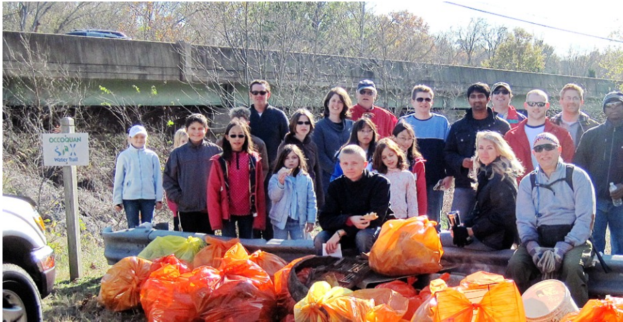
Volunteers in front of some of the trash removed from Bull Run on November 6th.

On Saturday November 6th, we had a great turnout at our last scheduled Adopt A Stream Cleanup of the year. 24 volunteers filled thirty bags with trash and carried out a number of other large items including 2 tires, the base of a shower enclosure, the stern of a fiberglass boat and a stainless steel double basin kitchen sink. Total weight collected 697 pounds.